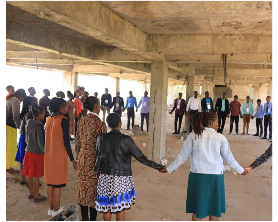
RSEC in Southern Nairobi Region at FOCUS Center, Kasarani brought together 34 students from 20 CUs. The retreat culminated with prayers at the Hatua construction site.