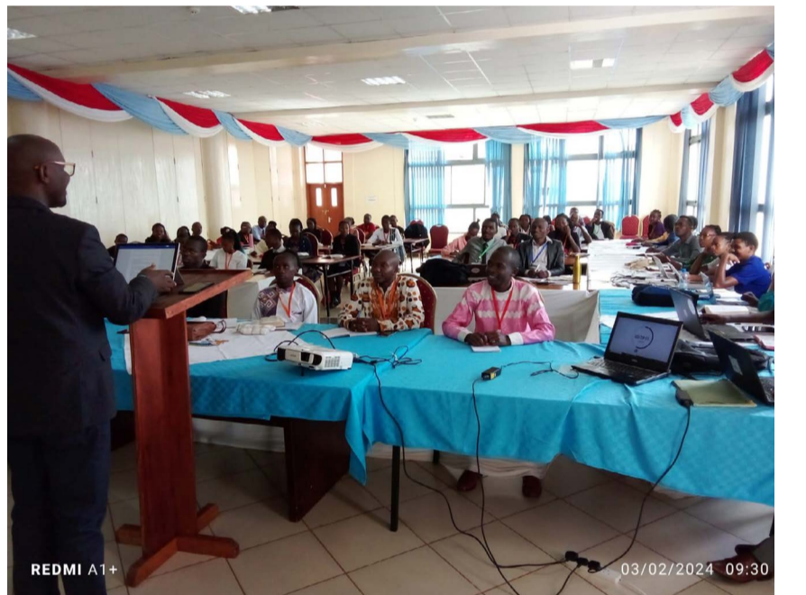
54 students from Mt Kenya Region gathered at Chuka University for RSEC. The highlight of the weekend was the sermon on upholding the Truth amidst Heresy.