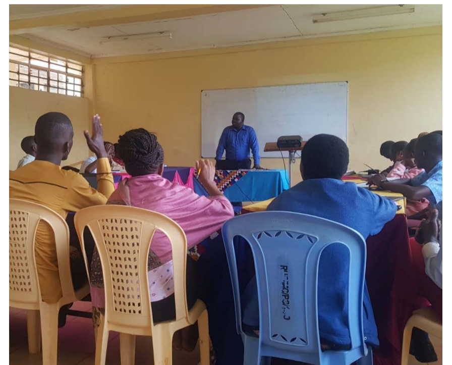
The first RSEC meeting of our new region, South Nyanza, 16 students from 9 CUs attended the meeting at Rongo University with 4 of them being appointed to lead the region. Praise the Lord for the great start in the region.