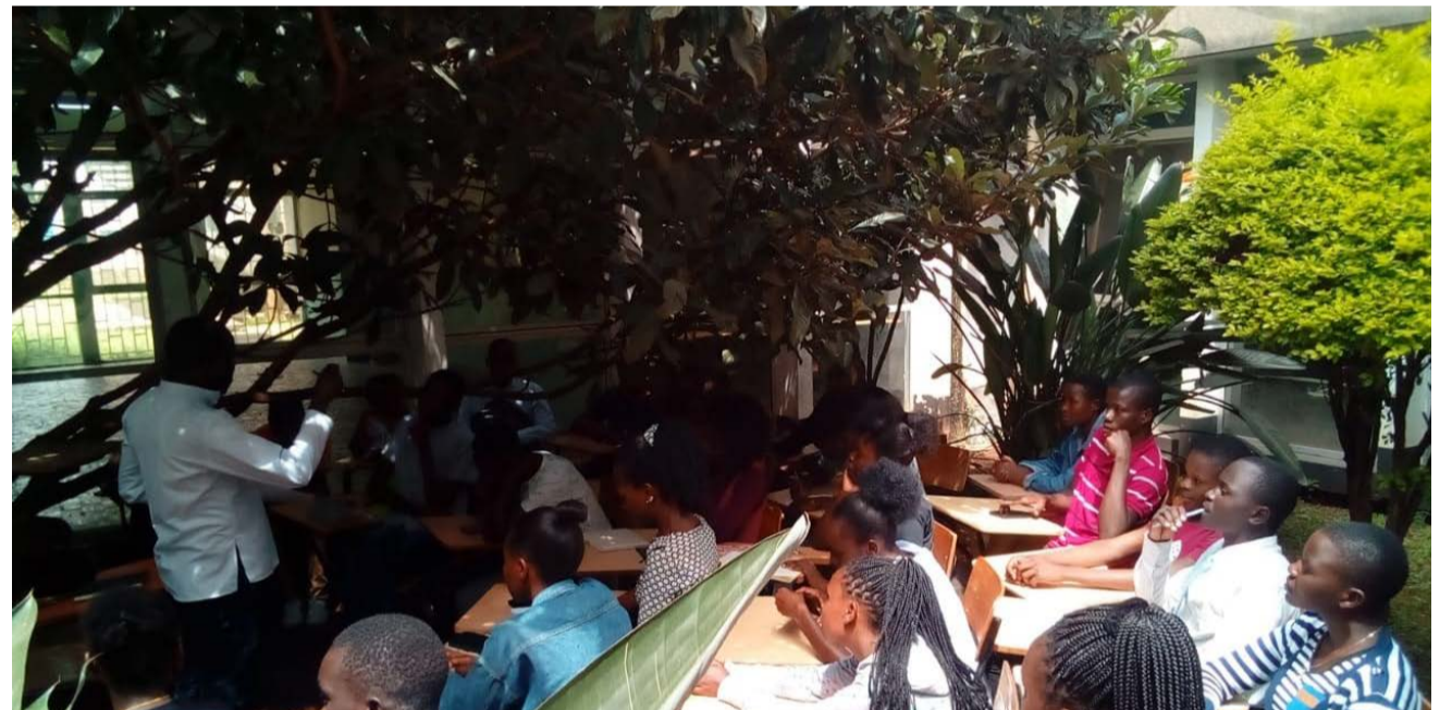
FOCUS Sunday at UON Kenya Science. Associates attended and had small group conversations with students in their year-of-study groups.