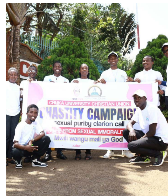
Highlights of Chastity Campaign Walks in Chuka, JKUAT and Machakos CUs.