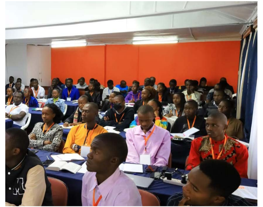
Highlights from NASEC meeting with 78 participants, inclusive of staff at FOCUS Center, Kasarani. The discussions were centered on consolidating ministry gains and advancing into new frontiers