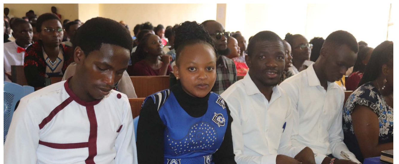
FOCUS Sunday at SEKU was an Ezra Conference follow up strategy, with a panel discussion on the key highlights of the Conference.