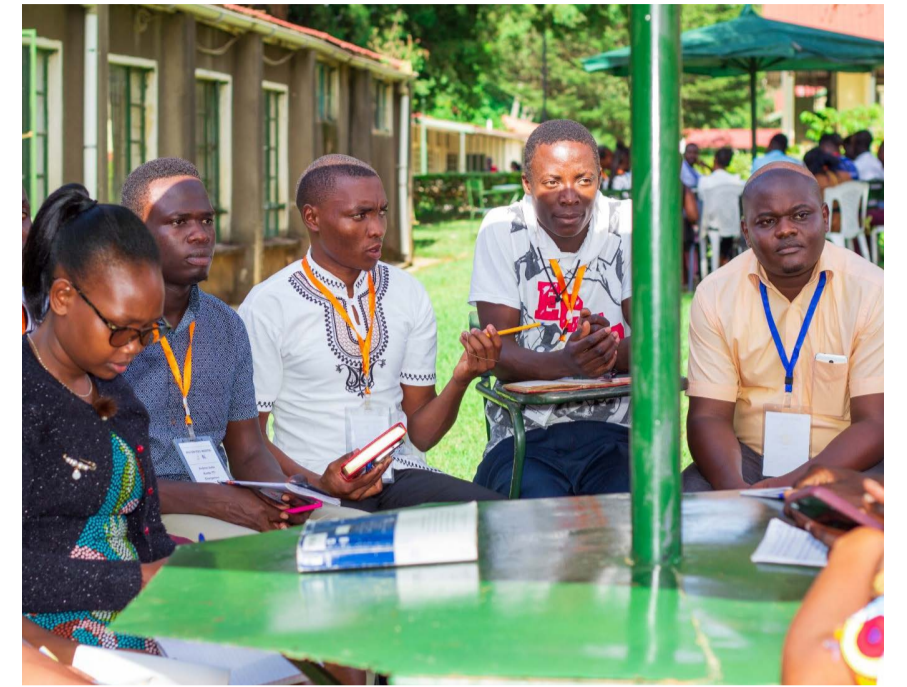
Western Region RSEC with 38 students gathered at Kaimosi Friends University. The small group discussions were the highlight of the retreat.