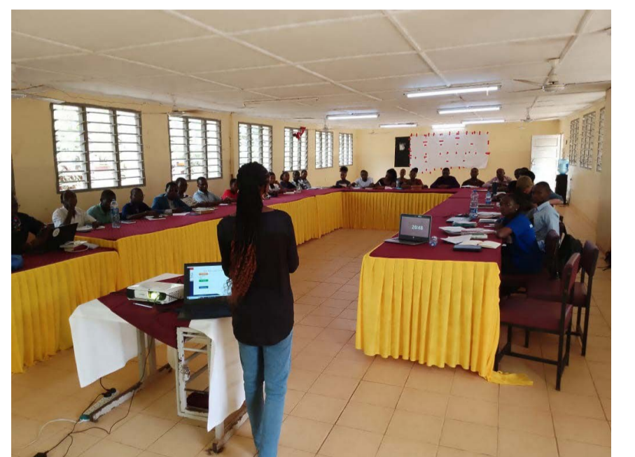
Pwani Region RSEC with 29 students from 14 CUs gathered at KMTTC Msambweni. The focus of the retreat was transformational leadership in the context of the region.