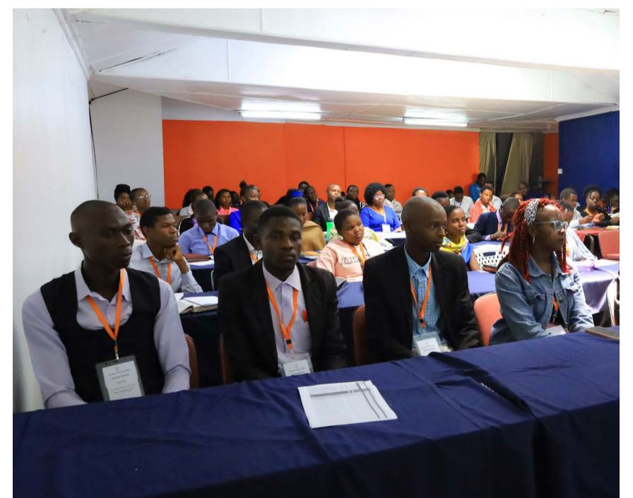
RSEC meeting in Northern Nairobi Region with over 60 student leaders at FOCUS Center, Kasarani. The highlight of the weekends were the capacity development sessions.