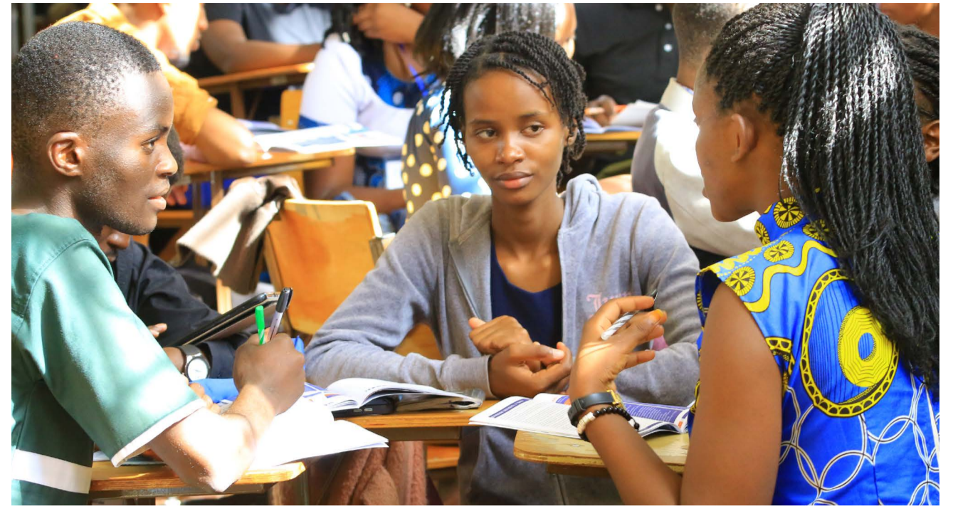
Students discussing in their small group Bible study sessions

An important goal of Ezra 2023 was helping the delegates to retrace their paths to Scripture centrality, dubbed as re-bibling . The over 70 seminars handled in the conference covered various theological and social issues. The speakers demonstrated the reality of God's Word being meaningful through all seasons in our lives. Personal devotions, prayers and small group bible study were useful for fueling the zeal for the Word of God.