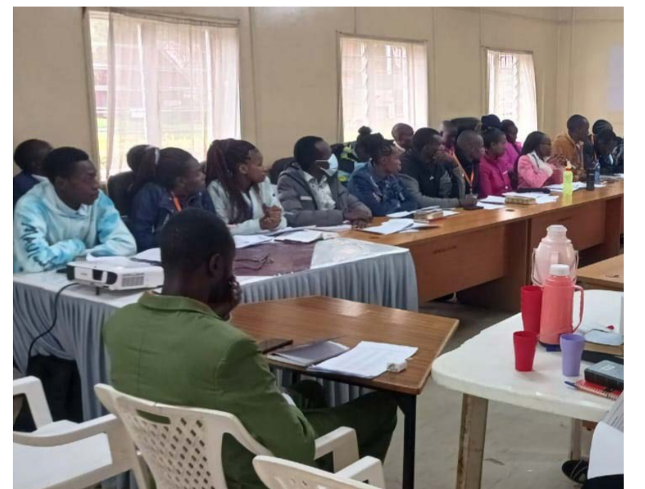
The Central Rift RSEC attracted 40 students from 18 CUs. The retreat took place at Laikipia University and the theme was Building on the Foundation of Christ.