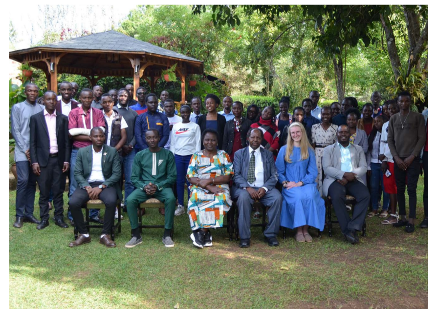
34 students gathered at Moi University Main Campus for the North Rift RSEC. Among the highlights were a Heart-to-Heart talk, a walk, and a special visit to an associate's home.