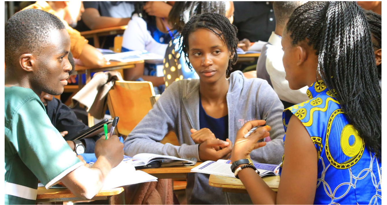
Delegates discussing in their small group Bible study sessions

An important goal of Ezra 2023 was helping the delegates to retrace their paths to Scripture centrality, dubbed as re-bibling . The over 70 seminars handled in the conference covered various theological and social issues. The speakers demonstrated the reality of God's Word being meaningful through all seasons in our lives. Personal devotions, prayers and small group bible study were useful for fueling the zeal for the Word of God.