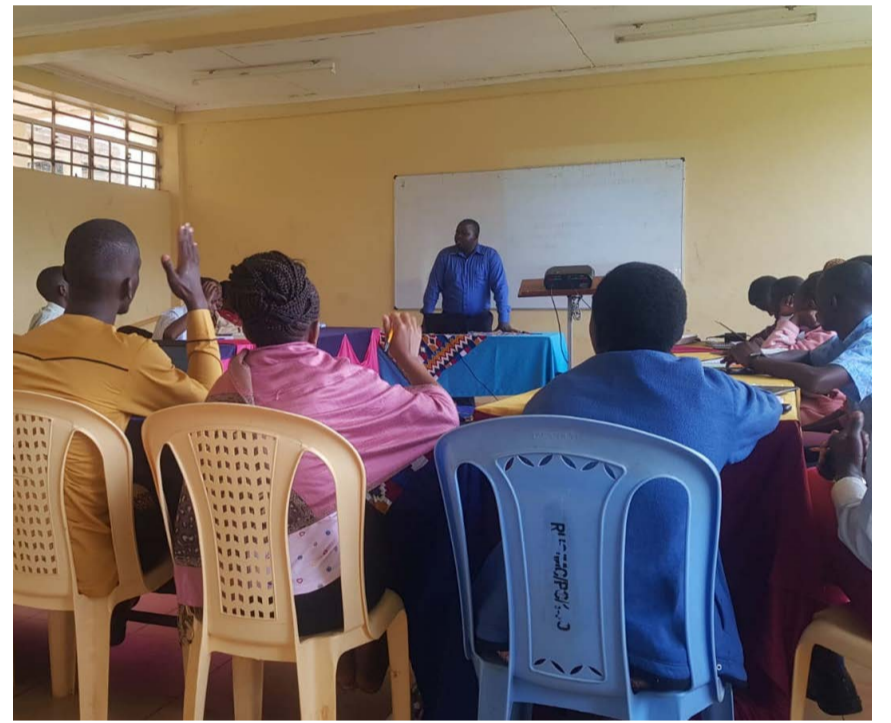
The first RSEC meeting of our new region, South Nyanza, 16 students from 9 CUs attended the meeting at Rongo University with 4 of them being appointed to lead the region. Praise the Lord for the great start in the region.