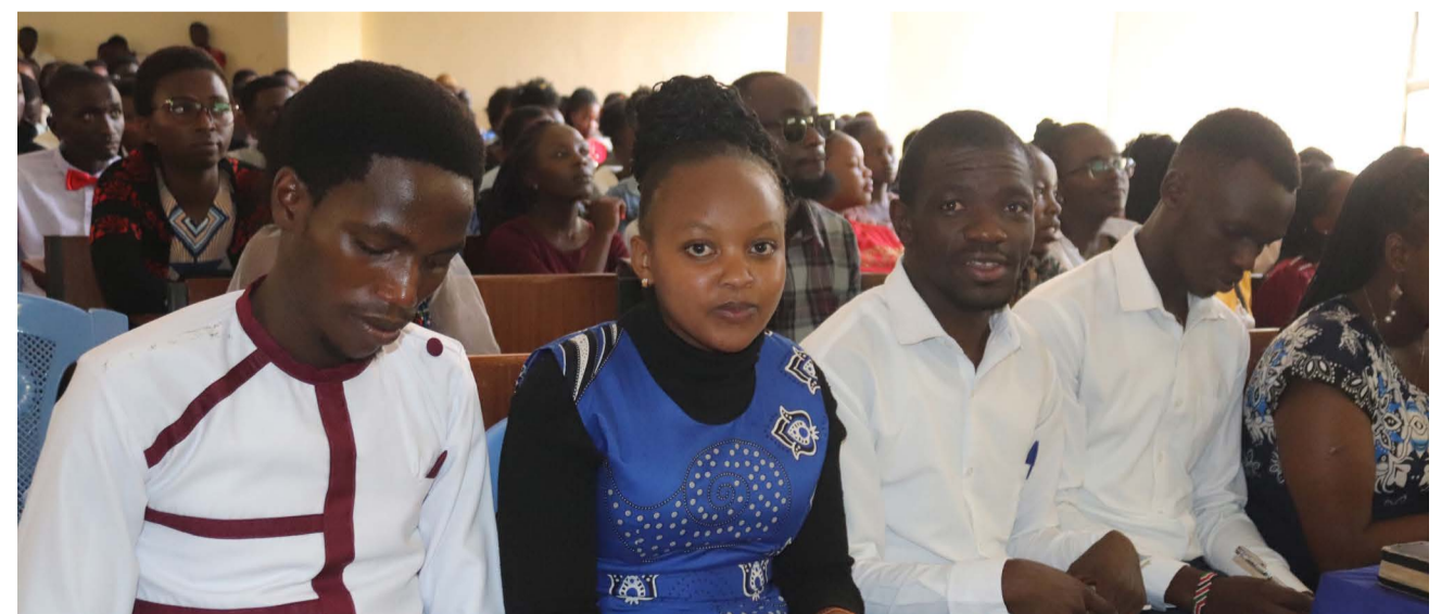
FOCUS Sunday at SEKU was an Ezra Conference follow up strategy, with associates from Kitui and Nairobi (left) facilitating a weekend long training.