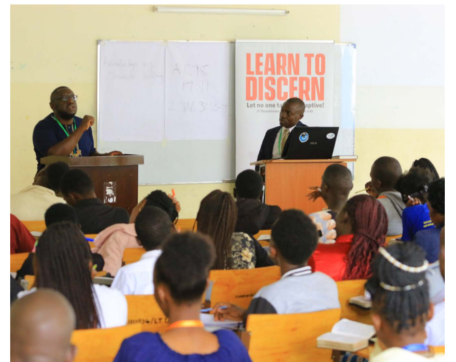
Seminars during the conference helping delegates to gain skills on Inductive Bible Study, Apologetics and how to apply God's Word to their circumstances.