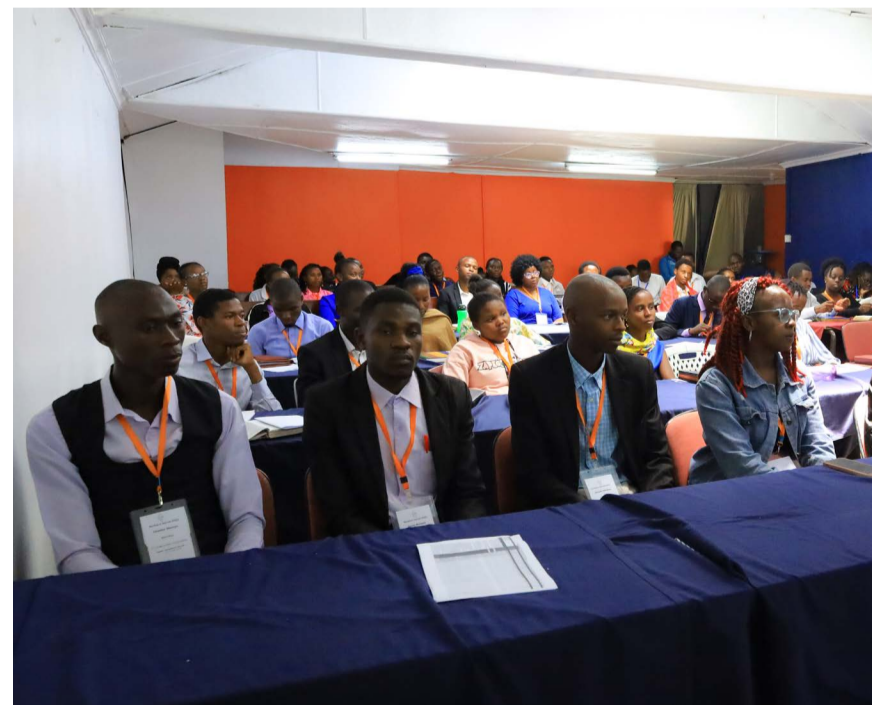
RSEC meeting in Northern Nairobi Region with over 60 student leaders at FOCUS Center, Kasarani. The highlight of the weekends were the capacity development sessions.