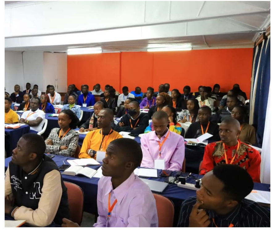
Highlights from NASEC meeting with 78 participants, inclusive of staff at FOCUS Center, Kasarani. The discussions were centered on consolidating ministry gains and advancing into new frontiers