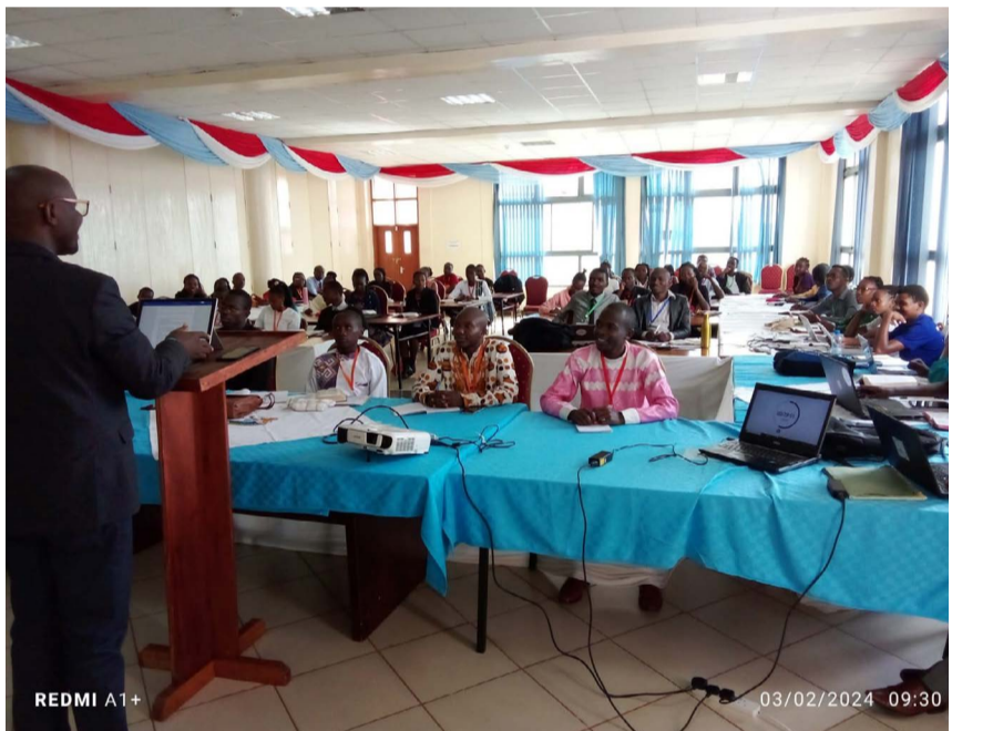
54 students from Mt Kenya Region gathered at Chuka University for RSEC. The highlight of the weekend was the sermon on upholding the Truth amidst Heresy.