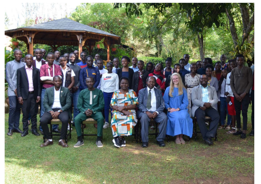
34 students gathered at Moi University Main Campus for the North Rift RSEC. Among the highlights were a Heart-to-Heart talk, a walk, and a special visit to an associate's home.