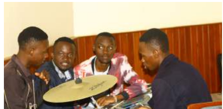
Highlights from the Western Region's Mini-Ezra