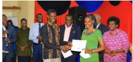
Highlights from the 50th Annual General Meeting