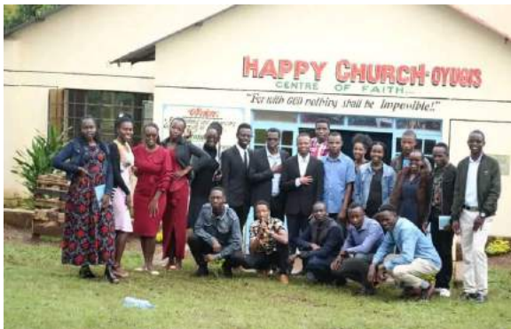
University of Kabianga, Kapkatet Kampus CU members in a mission at Oyugis

The students had programs to engage young children and mentorship for community youths. These helped their audiences to comprehend the gospel while challenging them to pay attention to their spiritual growth. 125 people came to the faith.