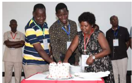
Highlights from the Associates Retreat