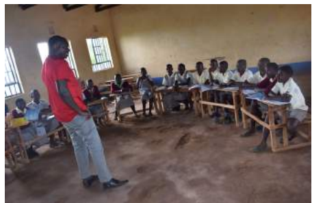
Missioners from Southern Nairobi sharing the gospel in Kasyalani schools.