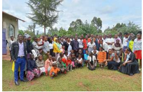
Egerton Njoro CU members together with their hosts at Likuyani

Creative street evangelism is one of the effective ways of capturing the attention of people in towns. This is what students from Egerton University Njoro campus CU applied in a mission at Likuyani subcounty Kakamega county. In one of the towns, they brought together the locals by doing a street dance contest. When a good enough crowd gathered, the dancing was slowed down to pave way for sharing of the gospel.