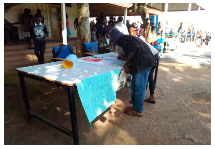
First-years' at JOOUST Bondo registering at the CU desk