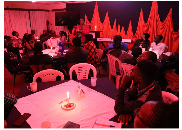
Staff doing inductive Bible study in a small Candle-lit heart-to-heart session for staff in their care groups