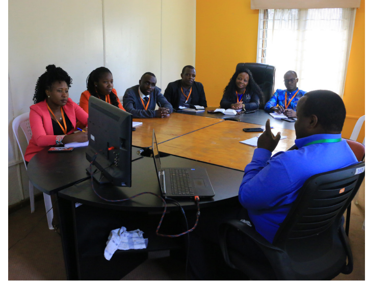
SOT Plenary session at the FOCUS Kenya hall