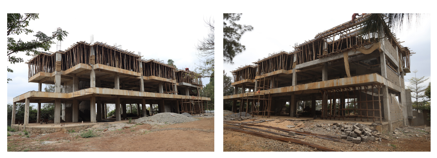
Hatua construction milestones at Kasarani

The ministry of FOCUS is a journey of faith. By faith, we reach out to build our resource pool and by faith the Lord supplies what we need. Praise God from whom all blessings truly flow!