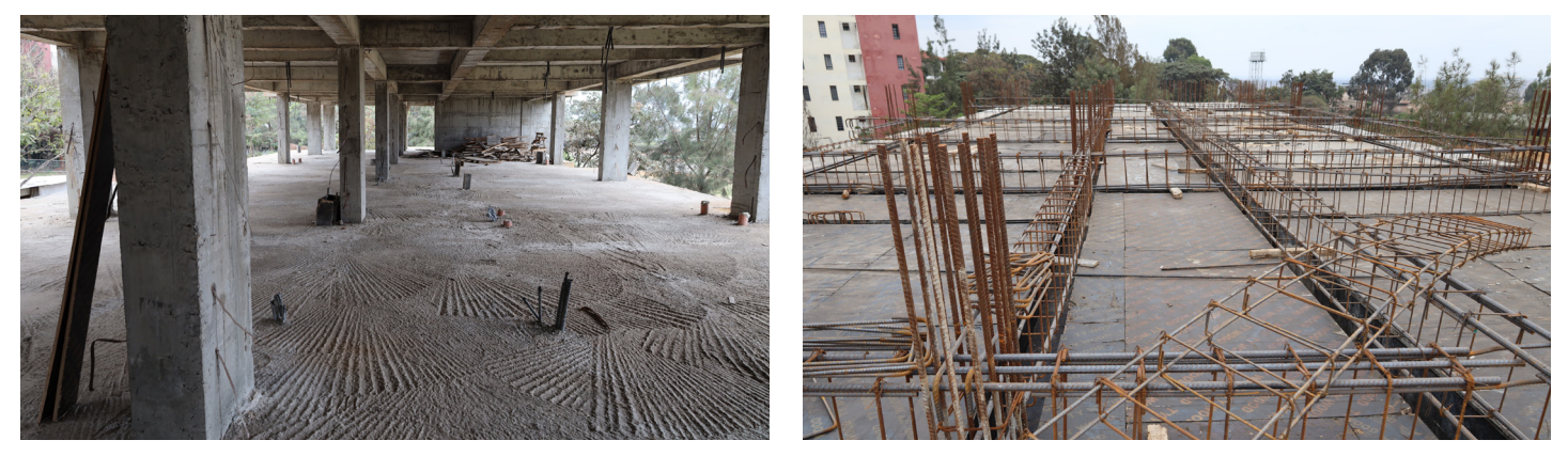
Inside the construction (left) and setting up for the 3rd floor (right)

To register for the Hatua fundraising dinner use this link.