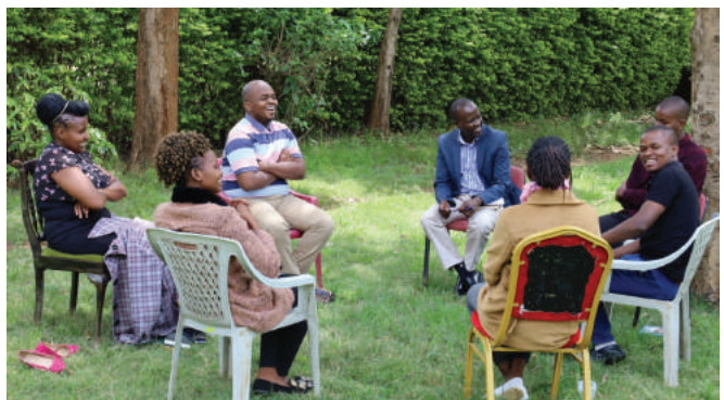
Small-group sessions; sharing ministry stories