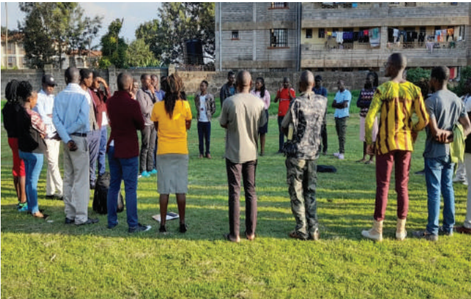
Kabete National Polytechnic CU members engaged in door to door evangelism and two days of open air in their college in May..