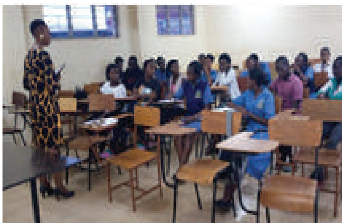
An associate facilitating Anza FyT session in March, helping new students in KMTC Voi to understand Christian living in a Campus setting, Twenty first years turned up.