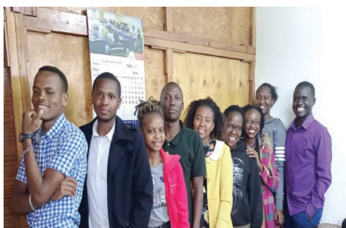
RSEC Handover and induction in Central Rift Region.