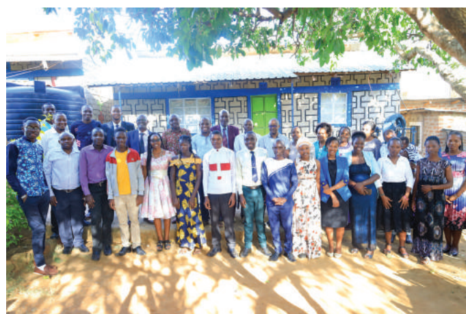
Mobilization of different Churches in Kitui for ministry participation.