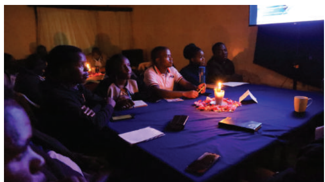
Staff dinner and discussions on inner healing