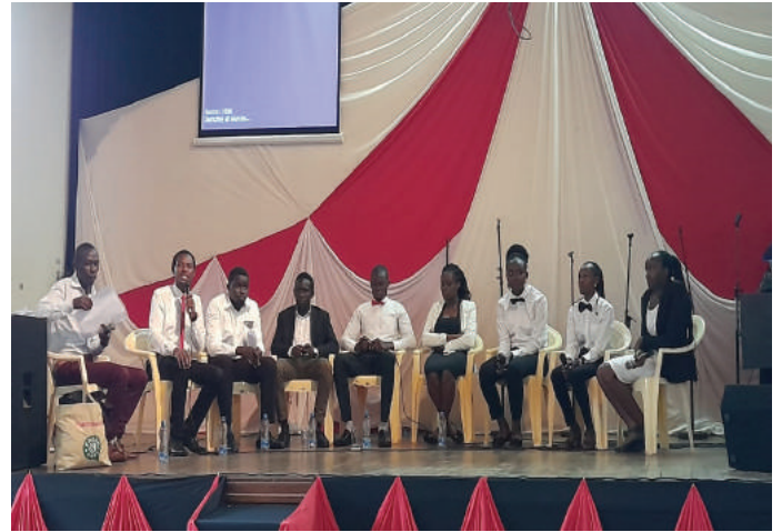
UON Upper Kabete Campus Christian Union Elders Night panelists sharing their experiences in campus.