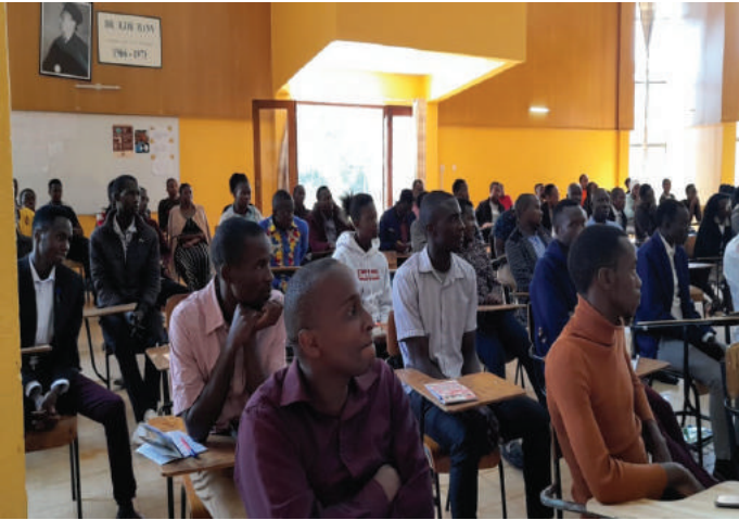
AHITI Kabete Christian Union members being trained on financial management by a FOCUS associate.