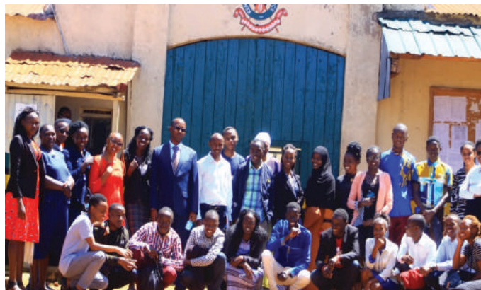
Baraton University Christian Union Fellowship members visited Kapsabet Prison where they had a wonderful fellowship with the inmates and gave out food items to the Prison.