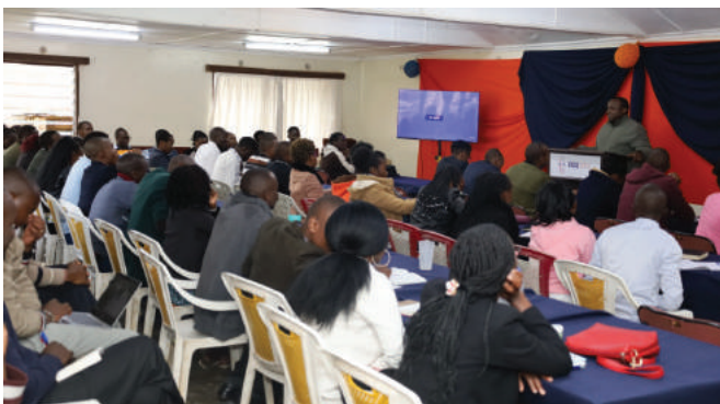
Welfare meeting for the STEM staff alone

The fellowship was a pleasant opportunity for staff to share their experiences in ministry and pray together and a rich ground for mentorship and the exchange of ideas among staff. Praise the Lord for refreshing us for more service.