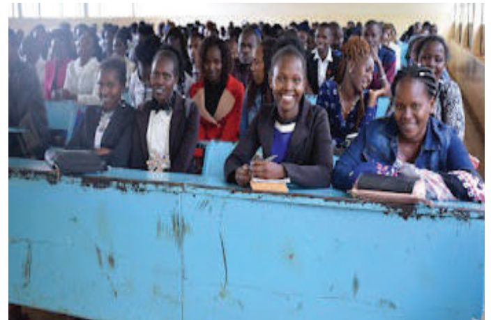
Moi University CU Elders (finalists) during a Vuka FiT session. The CU has released more than 300 vibrant students into the market place this semester.