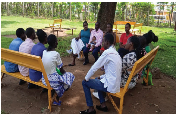
Mentorship Sunday at KMTTC Kisumu in April exploring how Christian students/youth can be champions of peace, not just during an election year but being active citizens engaged in the affairs of our nation.