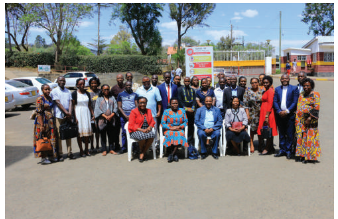
Fundraiser event for Nakuru Land in March