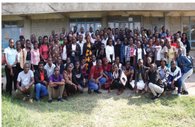
Narok Associates Branch breakfast with Finalists in April. 120 finalists attended