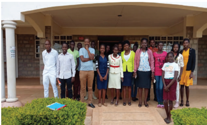
Koshin TTI staff, FOCUS staff & Students posing for a photo after the leaders training on 23rd March 2022. The training targeted leaders from; the Christian Union, Student Union and other society leaders.