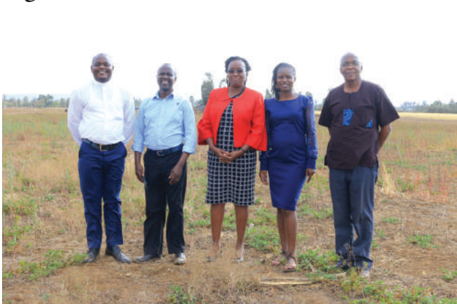
Site visit to the students' center land in Nakuru