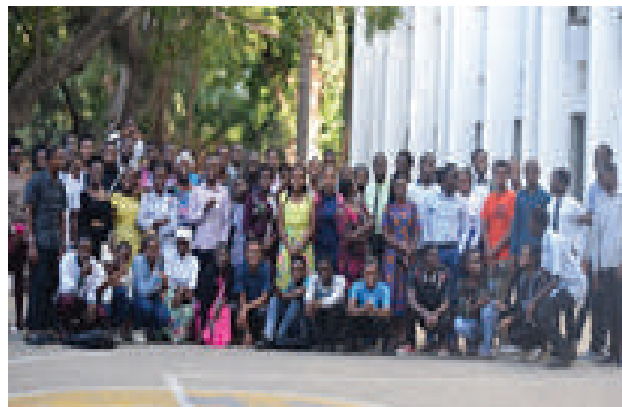
TUM first years during their last scripture insight class (Anza Fyt) where they sit down to reflect on what they have learnt during the whole spiritual year. Over 70 first years attended the scripture insight class bash.