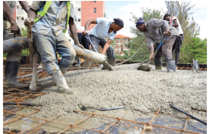
Status of the Hatua construction at Kasarani (left) and slab setting for 2nd floor (right)