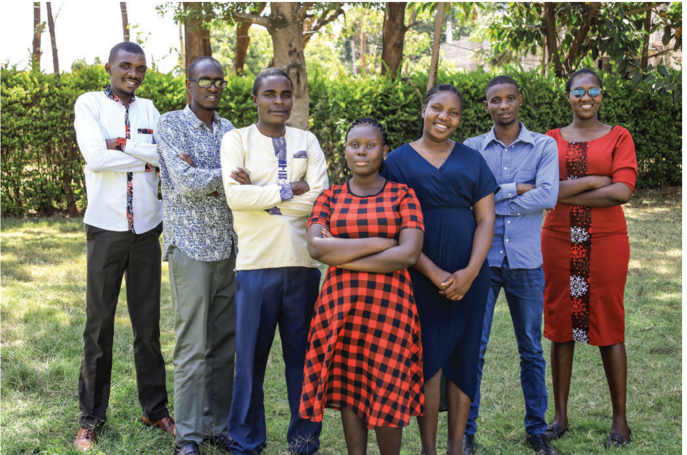
2022-2023 National Students' Executive Committee Officials after commissioning

Every year, ministry at FOCUS has unique engagements marked with growth, opportunities and challenges. We have had a refreshing season of reflecting on ministry in 2021 through various platforms. As is the practice for the first quarter of the year, a series of review meetings take place; to audit the Ministry's operations. We thank the Lord for successful Regional Students' Executive Committee, the National Students' Executive Committee, and the National Governing Council (NGC) meetings in March.