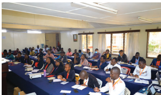
Members of the National Students' Executive Committee during the NASEC Weekend at FOCUS Center