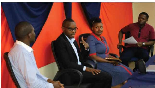
STEM alumni in a panel sharing their testimonies