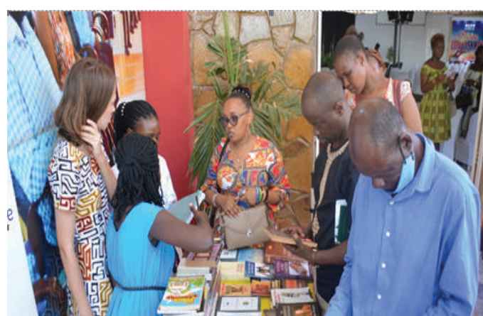
During a FOCUS awareness, associates mobilization and booksale at Praise Chapel Church- Mombasa in March.