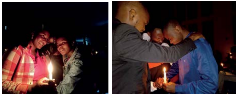
During the elders night at Kibabii University CU the final year students gathered together to celebrate and pray with the continuing students as they lit candles as a sign of handing the mantle and an encouragement to keep the faith.