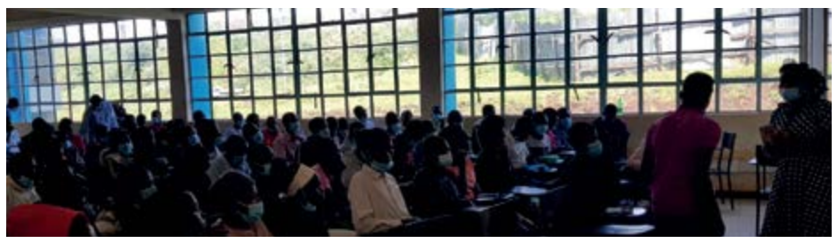
First years attending a CU orientation session in Kisii University