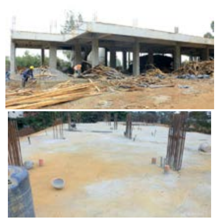
Hatua project in FOCUS Kasarani, Nairobi