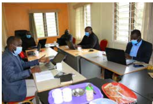
FOCUS Kenya Management Team meeting with the National Director