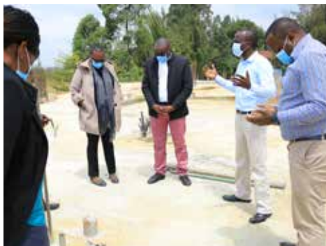
FOCUS Kenya Management Team praying together over the Hatua project