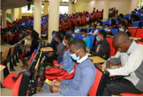
Cooperative University Christian Union Students bowing down for prayer during their FOCS Sunday held on 1st August 2021.