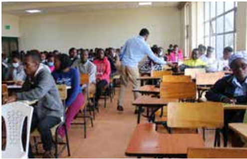
Leadership training at Meru University happened on Saturday 24th July 2021. 91 leaders were trained