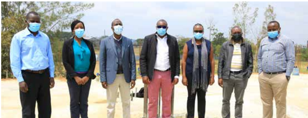
FOCUS Kenya Management Team posing for a photo

Finally, brothers and sisters, you may ask how we can do this better: