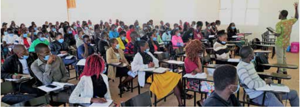
Early in July, the University of Eldoret Christian Union had a Mid-term Leaders Training aimed at reigniting passions for leadership. 105 leaders attended.