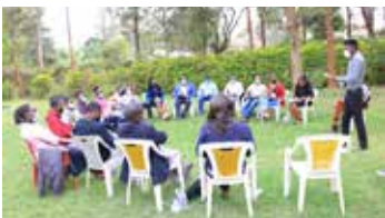
Utalii College Christian Union Leaders Training at FOCUS Center on 31st July 2021