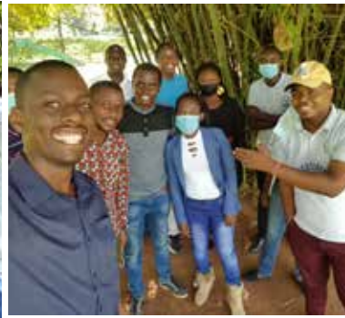
The western staff team had their retreat at Sosa Cottages to bid farewell to 2 of their STEM staff transitioning from the STEM program.