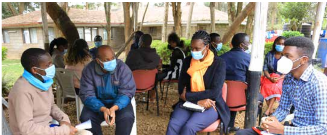
FOCUS Staff from Nairobi regions gathered in small prayer groups during their in-person devotion

One of the great tragedies that faced the people of God in the Old Testament is forgetting. The OT helps us appreciate what God did in the past, his grace and power among his people. The New Testament people are encouraged to look at the cross and recount God's faithfulness as encouragement in tough times and as a source of praise.