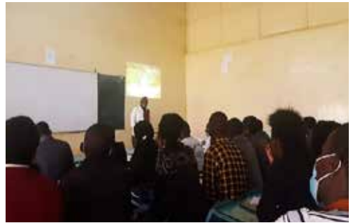
Moi University Main Christian Union in Leadership training