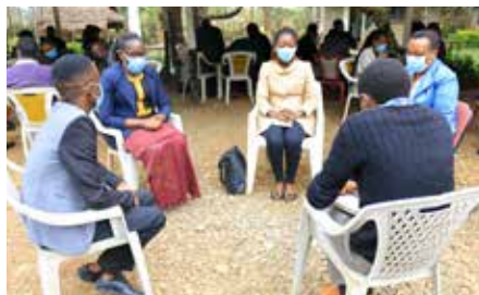
FOCUS Staff from Nairobi regions gathered in small prayer groups during their in-person devotion on 4th August 2021