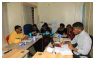
Wote Technical Institute Student Union Training at FOCUS Center on 30th July 21st -1st August 2021