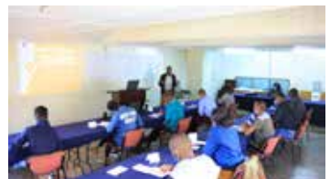
Kiambu Institute of Technology Christian Union Leaders Training at FOCUS Center on 30th July 2021-1st August 2021