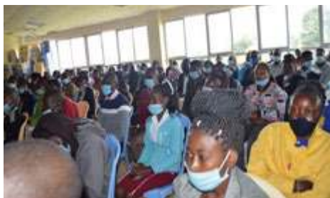
Leadership Training at Meru University Christian Union