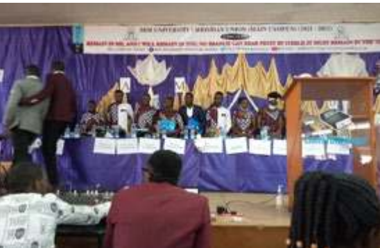
Incoming CU leader escorted to the stage during the CU AGM for Moi Main Campus on 28th February 2021

In the past three months, we have had several Christian Union leadership transitions and trainings. Pray for the new leaders to have the wisdom, confidence and the innovation needed to run ministry at such a time as this.