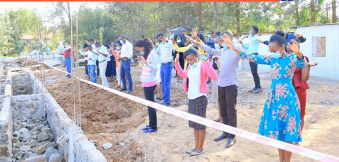
Northern Nairobi Region Student leaders praying for the Hatua project at the construction site of the Nairobi Students Centre on 6th February 2021

The journey to build Students Training Centers started three years ago. Despite the delay caused by Covid-19, the construction of the Accommodation Block at FOCUS Center Kasarani is beginning to take shape. We are grateful to God and all stakeholders who have given towards the project.