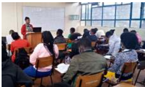
Embu University Leaders Training in February 2021