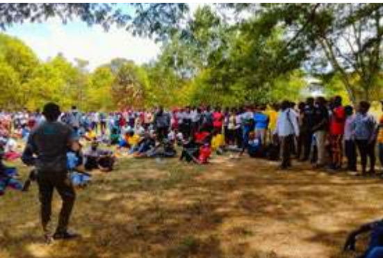
Egerton Njoro Campus CU first years' retreat in February 2021