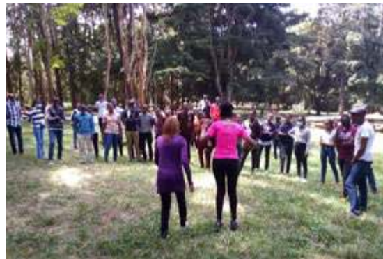
TUK CU during a first years retreat on the 30th January 2021

Over 6000 first years have joined CUs across the Colleges and Campuses. By God's grace we have run the first year's induction program (Anza Fyt) taking varied shapes. May God guide these fresh men and women to grow in their faith to maturity throughout their stay in campus.