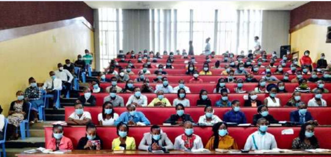
KMTC Nakuru Christian Union Sunday Service in session

Ministry among the students has been picking up since the resumption of the in-person learning. In light of the persistent Covid-19, we have had to constantly review our strategies as we trust God for wisdom to keep the FOCUS mission alive while taking care of one another. Pray for the safety of the students, faculty, and staff in these institutions. Our hope is in the Lord, and, soon, we will overcome.