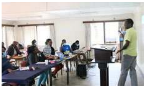
UON Medical School CU leaders Training at FOCUS Centre on 13th Feb 2021

Thika CUs Executive Leaders' Summit held on 20th Feb 2021 with 51 leaders from Thika CUs (Gretsa, Jodan College, Thika Medical School of Health Sciences and KMTC CU) in attendance. It was so fulfilling to see young people excited and committed to be equipped for effective leadership in their CUs. We appreciate Deliverance Church (Thika) for providing a meeting place for the Summit.