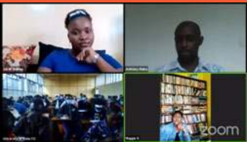
256 students and 17 Associates in a panel discussion on purity, singlehood, and marriage hosted by Mt. Kenya Region in February 2021

This February saw at least 357 students sign up a commitment form to remain chaste after week long campaigns on sexual purity; a program launched in 2016 with the aim of helping students deal with the issues of sexual purity. Should you need to make such a commitment click: