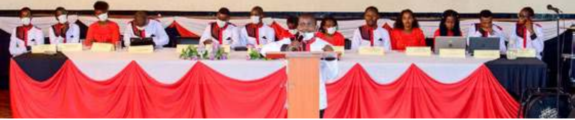
University of Nairobi (UON) Main Campus Christian Union Outgoing Executive Committee during the CU AGM held on 7th Feb 2021

The CU provides a fertile ground for leadership development. The annual transitions allow many Christian leaders to hold leadership positions in the Executive Committee and ministry departments. FOCUS plays a key role in equipping the leaders with the skills and competences needed to run the Christian Unions. A number of key leaders in the Church, Public service, and the private sector attribute their formation to the CU leadership experience.