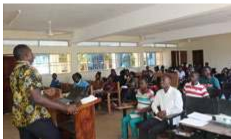
Pwani University CU Leaders Training on 6th March 2021