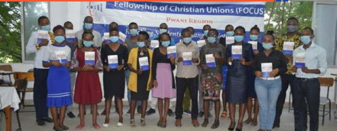
Pwani Region RSEC Retreat on 13th March 2021

We have had Regional leadership transitions in the seven regions in March. These leaders will be the first regime to implement the new FOCUS Strategic Plan 2021-25 amidst new environment and challenges. Pray for guidance upon them as they steer the ministry in the next one year.