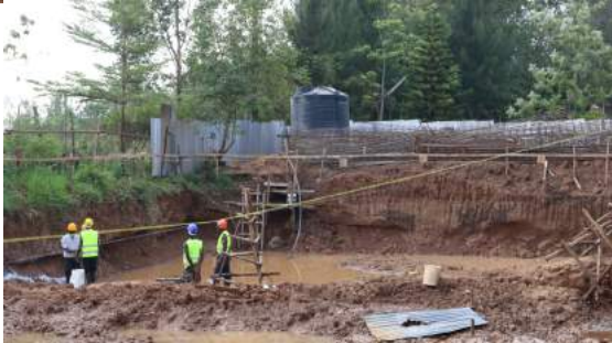
Left: Excavating the construction site Laying the foundation in December 2020