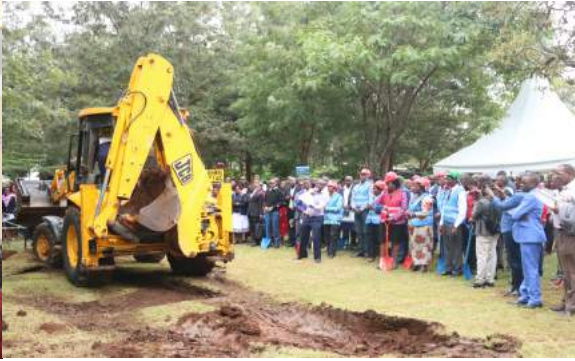
During Hatua Groundbreaking at FOCUS Centre on 4th May 2019.