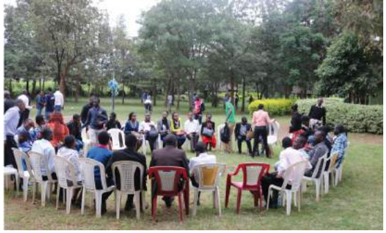
Students from Nairobi meet at the Construction site at FOCUS Centre to launch the project in 2018