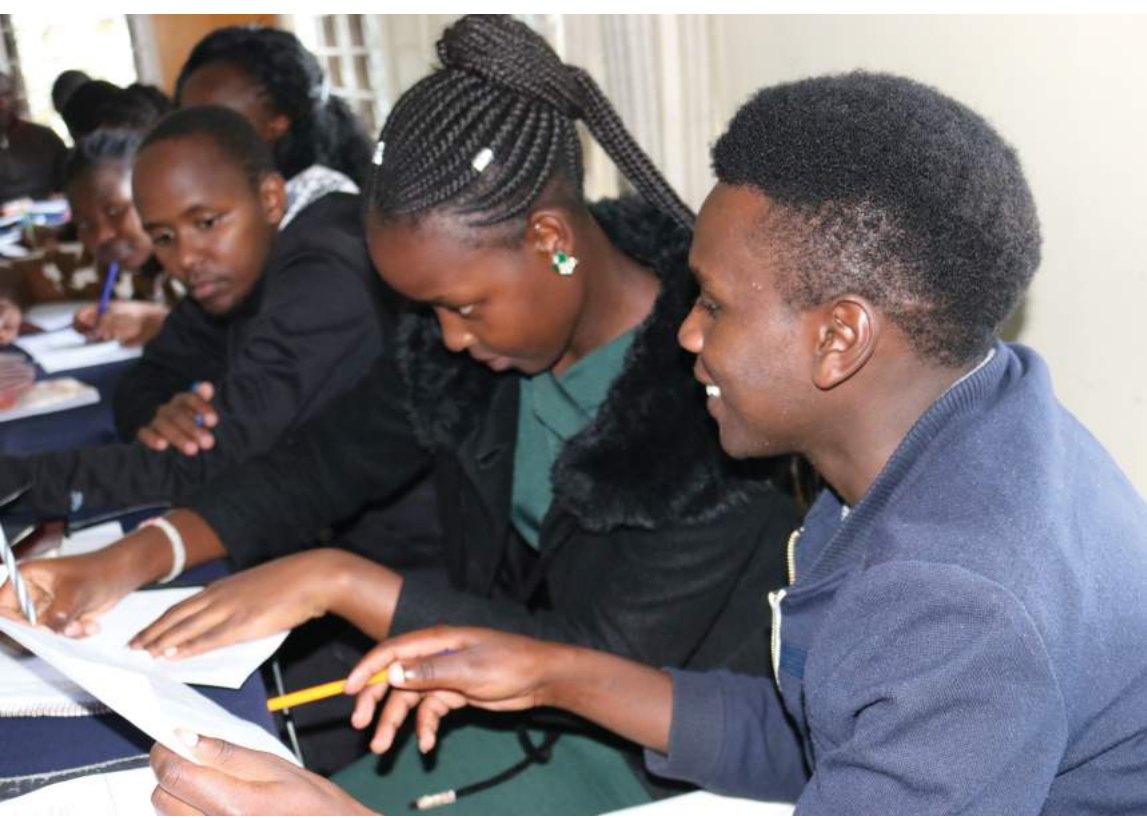
A training session for Christian Union Leaders at the Students Centre in Kasarani, Nairobi.