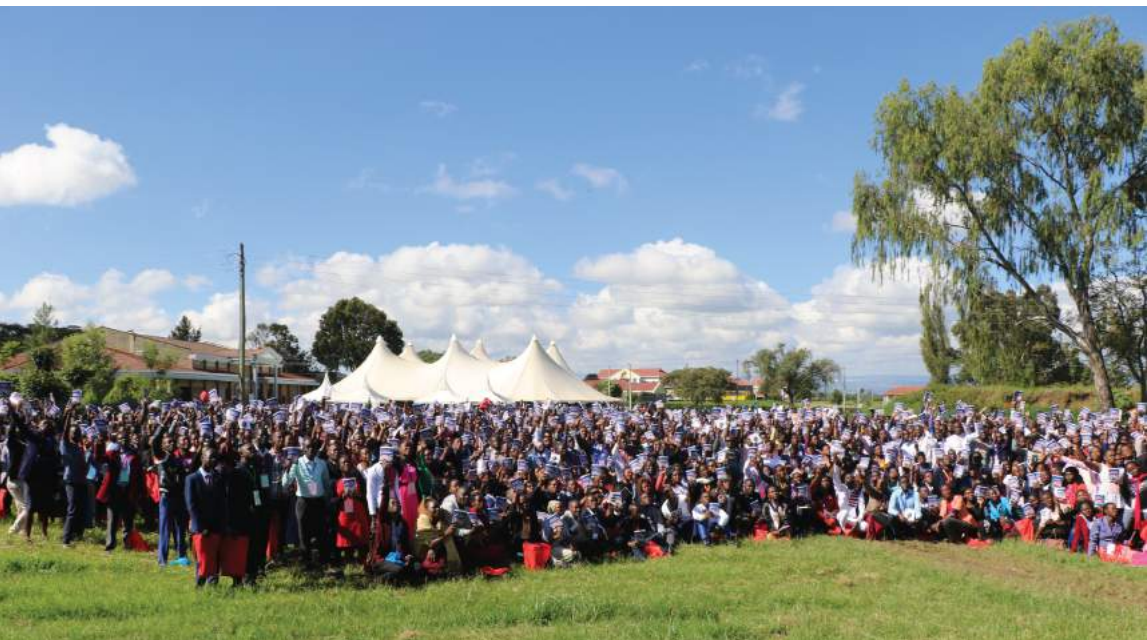
Over 3000 students gathering at Kabarak University for a FOCUS Conference in December 2020

One of the key limitations to achieving the optimal and projected number of students (10, 000) trained annually, is the inadequate training facilities. To bridge the gap, FOCUS intends to put up Students Training and Development Centres.