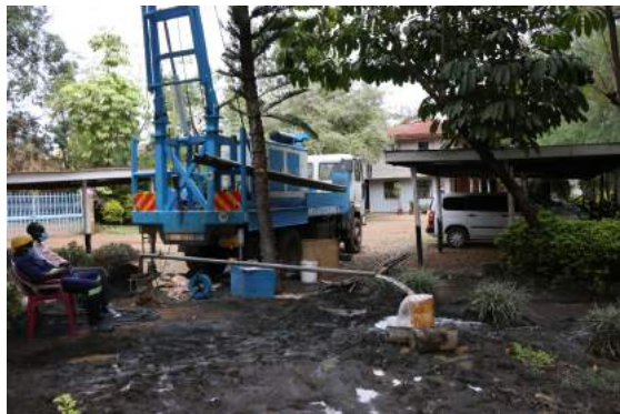
Drilling a borehole for the project