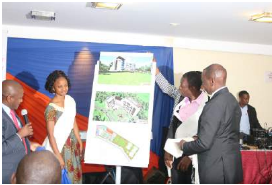
The first fundraising event held at Sarova Panafric Hotel on 2nd November 2018