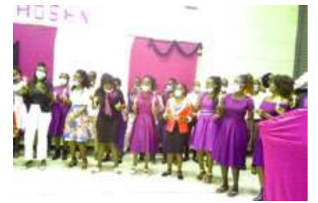
Moi Uni. West Campus Elder's Dance