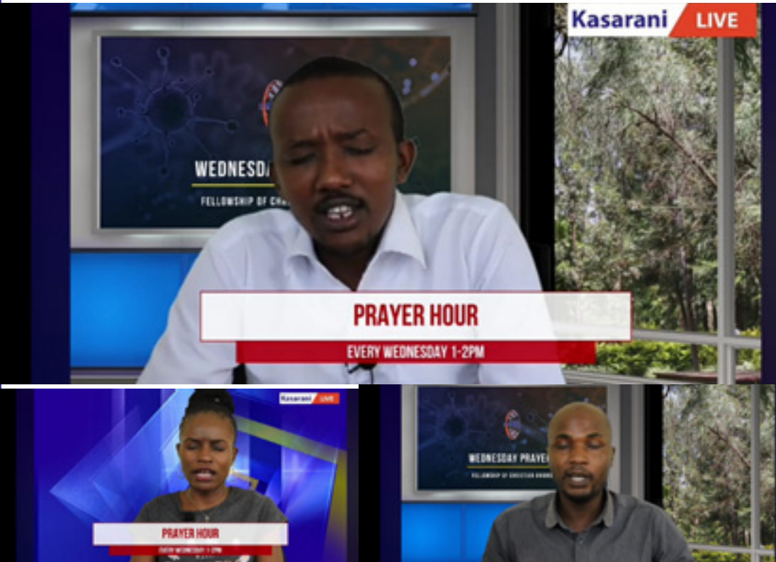
During a FOCUS weekly Prayer meeting broadcasted on facebook live

We have facilitated weekly prayer hour on Facebook Live. So far, we have had at least a cumulative 10,000 participants according to our facebook page insights. We have been also mobilizing students to host live prayer sessions for their CUs. It has been encouraging to see CU members praying together on whatsapp groups and in other platforms.