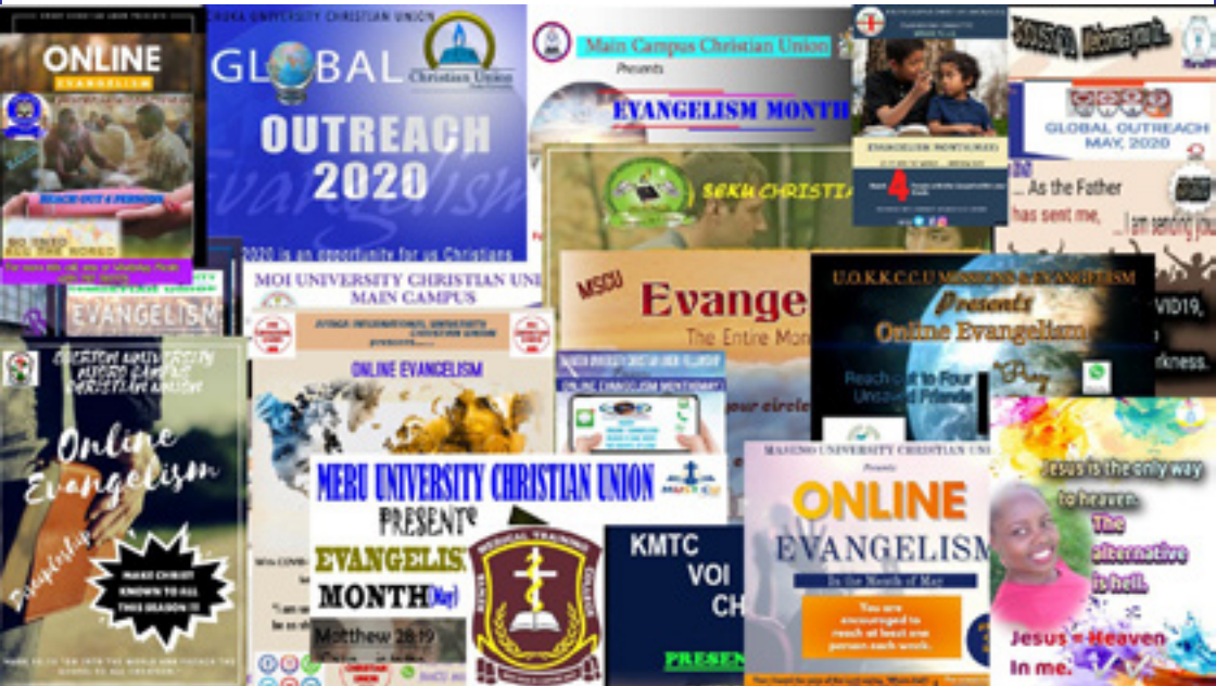
A sample of posters used by CU during the mobilization effort for the Evangelism Month

FOCUS joined the global Christian community in the Evangelism emphasis in the month of May organized by GO2020. After an online Evangelism training for CUs organized by FOCUS Kenya, digital mobilization and evangelism was launched. The earnest enthusiasm expressed by students and staff saw at least 2000 students reaching out to over 3000 non-believers. So far, 110 new believers have been reported as a result of these efforts. Pray for them and for sustained passion in the ongoing evangelistic events by the students and Associates.