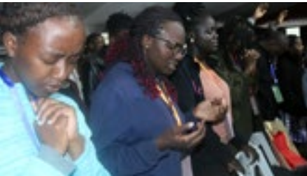
A Worship Session during the Conference