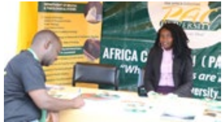
An Exhibition booth during the Conference