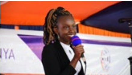
A Delegate testifying in a Bible Exposition session