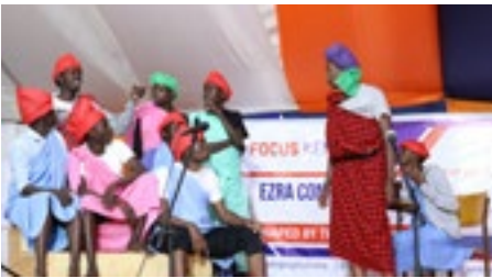
Creative Arts performance on the life of Peter