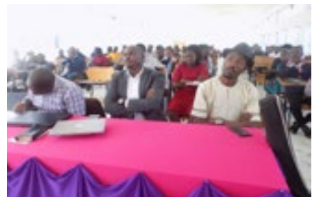
During Central Rift Leadership Summit held in Laikipia University in February 2020