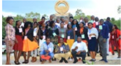
EZRA 19 Delegates from Kisii University