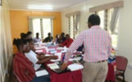
UON Main Campus Christian Union Leaders Training at FOCUS Center Kasarani in Feb 2020

The Christian Union is a rich ground for leadership development. Training is one of the ways through which leaders are made. Pray for all new leaders who have assumed different roles in the CUs.