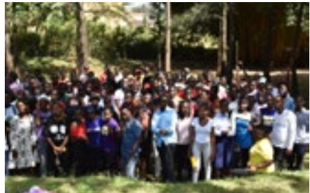
Masinde Muliro University CU during a retreat on 22nd Feb 2020 at Serve International Ministries grounds in Kakamega.