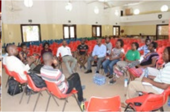
FOCUS Associates from Mombasa Associates branch assembled at Technical University of Mombasa for a students ministry capacity building on 7th March 2020

To Join FOCUS ASsociates Visit: https://www.focuskenya.org/associate-membership/