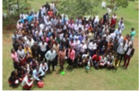
Delegates in Western Region Leadership Summit

The leader's greatest influence lies in the example they lay for others. In an era where leaders have been known to 'preach water and drink wine'. The leader's greatest hinderance is not without, it is within, if a leader would master his body and appetites then leading others wouldn't be huge a task as it were. Leaders are meant to lay a pattern of faithfulness, integrity and commitment for others to see and peradventure, follow.