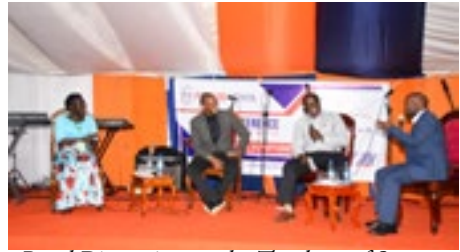
Panel Discussion on the Theology of Success