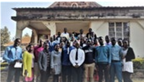
North Rift Regional Students Executive Committee in Moi College of Health Sciences in February 2020