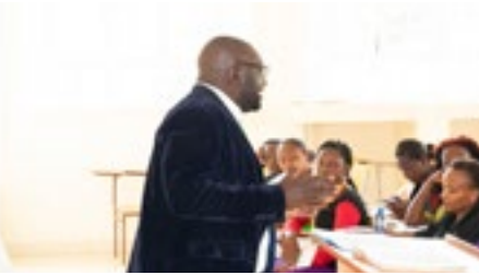
During a Seminar on the Bible and Creative Arts