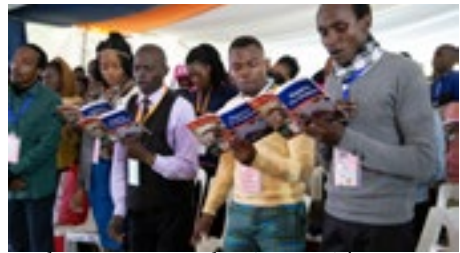
Delegates enjoying the EZRA 19 Theme Song