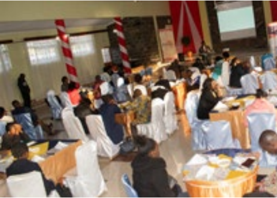
67 FOCUS Central Rift Region Associates in a prayer Breakfast meeting held at Nuru Palace Hotel on 22nd Feb, 2020.