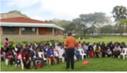
North Rift Delegates Debriefing in EZRA 19