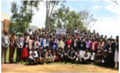
National Evangelism and Missions Summit (NEMS) Delegates at JKUAT

138 missions and evangelism leaders from 89 Christian Unions filled the lecture theatre in JKUAT main campus on the evening of Friday, 31st January 2020. The big question explored throughout that weekend was on how to take the “The Transforming gospel on campus and beyond” as captured in the theme of the Summit inspired by Isa. 49:6b that “I will also make you a light for the Gentiles, that my salvation may reach to the ends of the earth.”