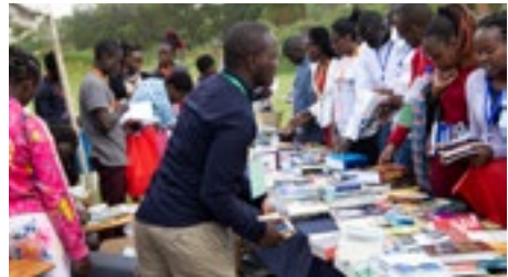
Delegates enjoying huge discounts on Books