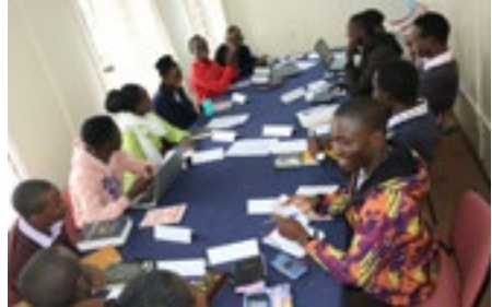
Kenyatta University Main Campus Christian New Leaders Training at FOCUS Center Kasarani in January 2020