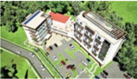
Aerial view of the envisioned students Training centre for Nairobi.

Upon receiving all the necessary approvals, the actual construction started in February 2020. The total cost of the project phased in three, including purchasing of land for the regions out of Nairobi is Ksh. 300 M and is expected to be completed in the next three years. So far Ksh. 42 has been raised in cash and pledges. For more details visit: focuskenya.org/hatua/