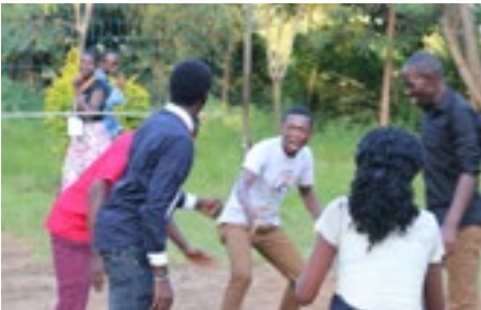
CU Leaders of UON Parklands and Lower Kabete Campuses during Training at FOCUS Center Kasarani in Feb 2020