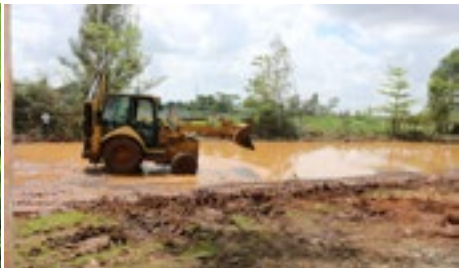
Ongoing excavation and reclamation in readiness to lay the foundation

You can be part of this great initiative by supporting via: SupportHatua or through Mpesa Paybill No. 412 412 A/C Name: Hatua2020