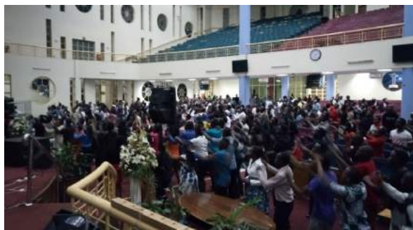
At least 800 Southern Nairobi Region Students gathered in Nairobi Baptist Church for a Prayer Kesha