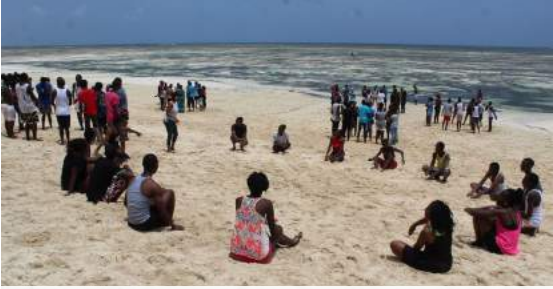
Technical University of Mombasa CU Leaders Retreat @ Shelly Beach