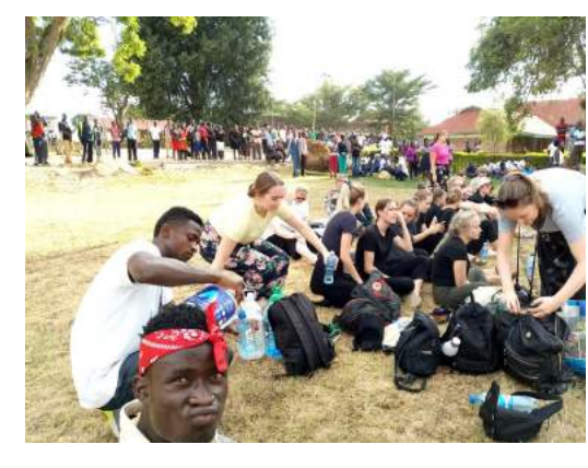
College Outreach by Kaimosi Friends University College CU in conjunction with Filadelfia bibelskole Oslo and K-Crew.