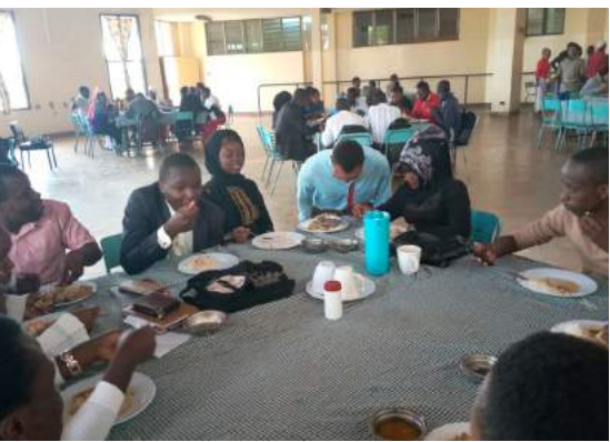
Moi University Main Campus Varsity Mission office to office evangelism, hostel evangelism, crusades and campus clean up among others.

The climax of the evangelism week was a visit to the GK Prison in Kilimo. Here, the students not only shared their faith with the residents, but also brought them personal effects. Three inmates gave their lives to Christ. To God be the glory.