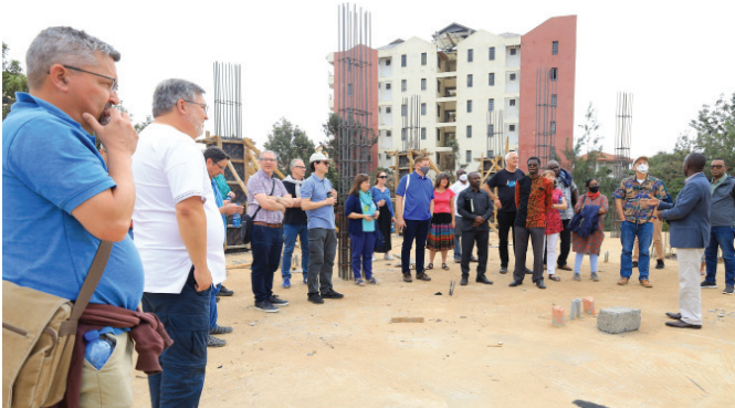
Tour of IFES leadership at the 2nd floor of the Hatua construction

In June, we had our first staff meeting of the year to review the implementation progress of the 2021-2025 Strategic Plan. It was a delightful time of fellowship and mutual encouragement to the staff. We had a chance to celebrate the milestones in Ministry operational accomplishments thus far.