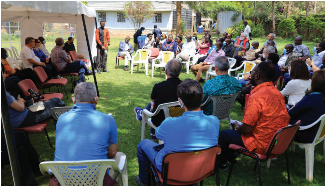
IFES leadership having lunch with FOCUS Kenya staff at the Kasarani Center