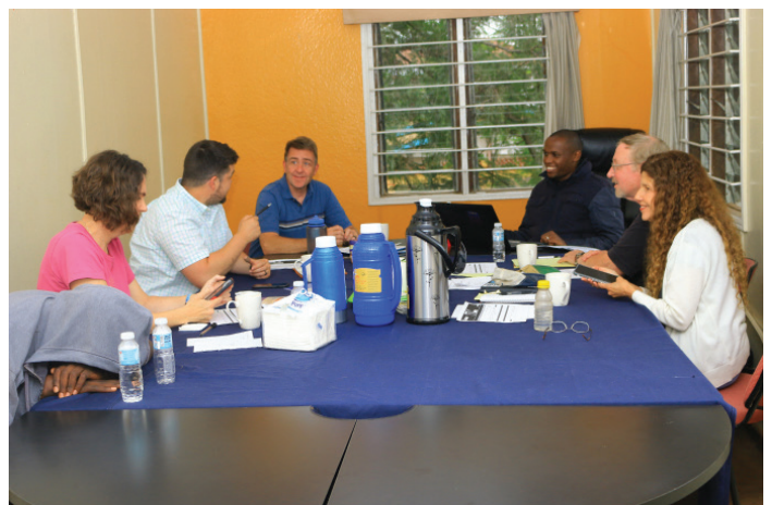
Handover meeting of the GP Directors at FOCUS Center