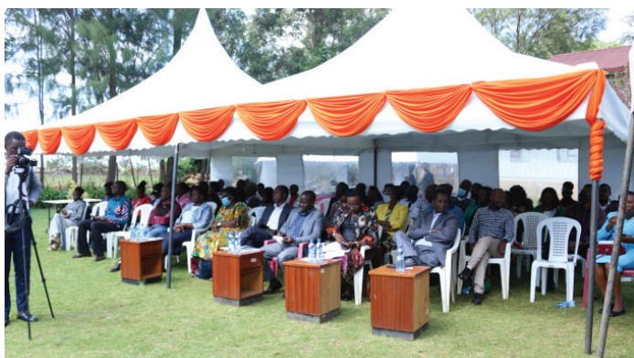
Stakeholders during the Hatua Fundraiser

The Lord has truly supplied for this work so far and we praise Him. We pray that He will favor us in the initiatives to resource for the Ministry.