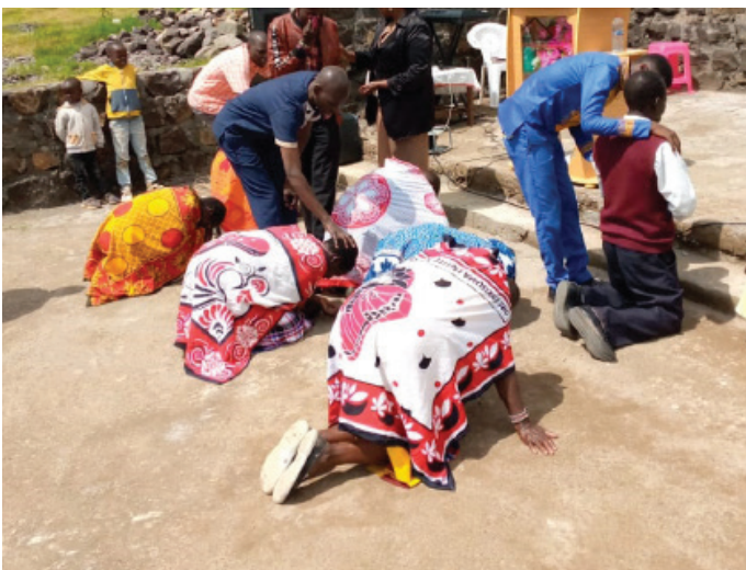
Students of Thika School of Medicine praying for people in a mission in Narok.

We thank the Lord for a chance to share the gospel openly and pray for those who came to faith from the evangelism activities.