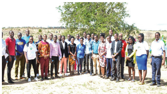
Fellowship of stakeholders in Pwani during a Regional Land Visit.