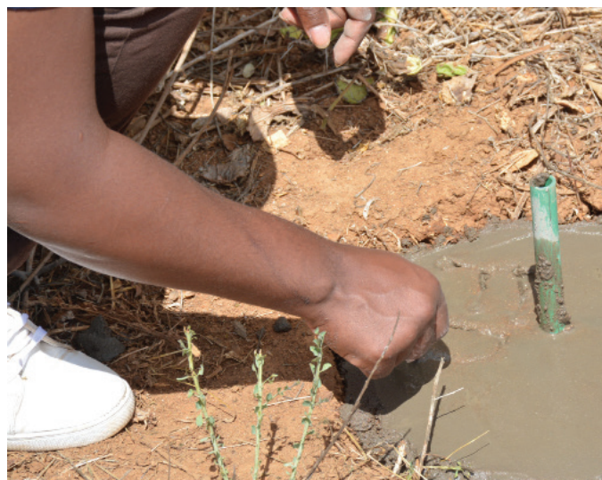
FOCUS staff in Pwani Region labelling a beacon in the Regional Land.

The ministry work of FOCUS is growing rapidly. More students are within our reach and we hope to extend our reach to more institutions. This reality is humbling to us whom God has entrusted with this work. To match the growth of the stakeholders, we have been trusting God for more resources for infrastructural expansion (Hatua). In June, we had a fundraiser for the Hatua construction in Kasarani and were pleasantly refreshed by the gifts of God's people. The work on the 3rd floor of the construction is set to begin soon.