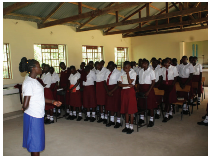
Students of Tom Mboya University sharing the gospel to high schoolers in Imbo.