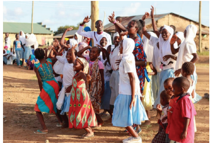
Students of UoN Chiromo CU teaching the gospel to community clusters in Kibandaongo.

In the last 2 months, Christian Students have held annual missions around the country. Evidently, students have grown in knowledge of apologetics (defending the faith), especially when engaging people of other faiths.