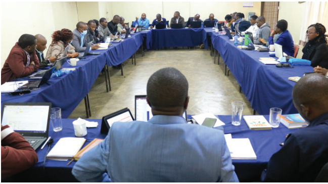
Review meeting of FOCUS staff in the FOCUS Center Hall