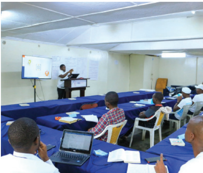
STEP interns cohort for NCKK in a training at FOCUS Center.

In June, we recruited, trained, and commissioned for service the first 9 interns for NCKK and are glad to hear they have settled well into their roles. We are on course with the recruitment and training of 12 interns for the Ufungamano Christian Students Leadership Center. Pray that this program will meet its objectives and have fruitful outcomes for the graduates, organizations, and the ministry in FOCUS.